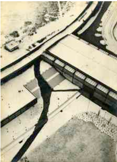
LÁSZLÓ MOHOLY-NAGY (1895-1947), 'View from Berlin Radio Tower in Winter', 1928 - 1930, gelatin silver print