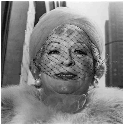
DIANE ARBUS (1923-1971), 'Woman with a Veil on Fifth Avenue, New York City', 1968, gelatin silver print

FIAC. Foire Internationale d'Art Contemporain