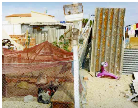
JOACHIM BROHM (*1955), 'Backyard, from the Portfolio 'Culatra', 2008, c-print

inhabited island manifested transitional spaces in which signs of modest use and infra structure shape nature: sand pathways, makeshift buildings, vehicles, boats, and seemingly unusable discarded things. On these he affixes his inquisitive and astonished gaze.