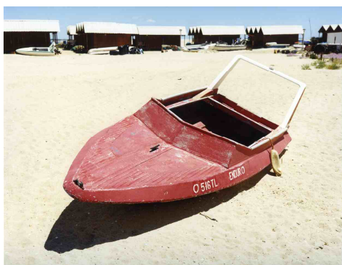
JOACHIM BROHM (*1955), 'Boat #1, from the Portfolio 'Culatra', 2008, c-print

Joachim Brohm's series 'Culatra', created in Portugal from 2008 to 2010, is the focus of Kicken Berlin's fall exhibition. It is the first time the series is shown in its entirety in Berlin. Kicken Berlin is presenting the similarly named portfolio of 24 images as well as further pictures of Ilha da Culatra off the southern coast of the Algarve.