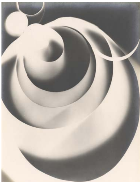
MAN RAY (1890-1976), 'Untitled' from the album 'Champs Délicieux', 1922, gelatin silver print

A dialog also unfolds with early modernist photography that touches on themes of mysticism and the spiritual. It becomes obvious for instance in the early series ...Höhere Wesen befehlen... (...Higher Beings Ordain...) (1968) which assembles a number of images of the most ordinary, yet enigmatic kind. The seemingly miraculous imprint of light on photographic paper in the early manifestations of cameraless photography is one of the highlights