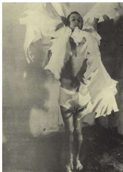
SIGMAR POLKE (1941-2010), from '...Höhere Wesen befehlen', 1966-68