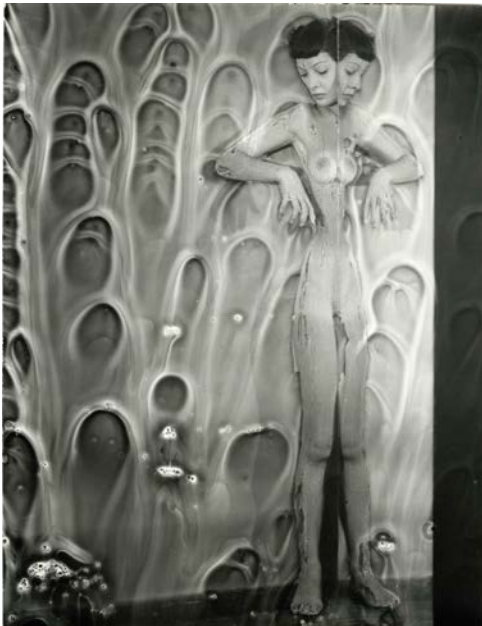
ERWIN BLUMENFELD (1897-1969), 'Mirror Nude with Chemicals, NYC', 1950s, gelatin silver print