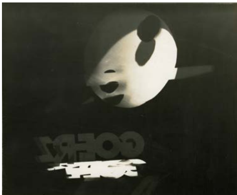
LÁSZLÓ MOHOLY-NAGY (1895-1946), 'Photogram', ca. 1925, gelatin silver print of a photogram