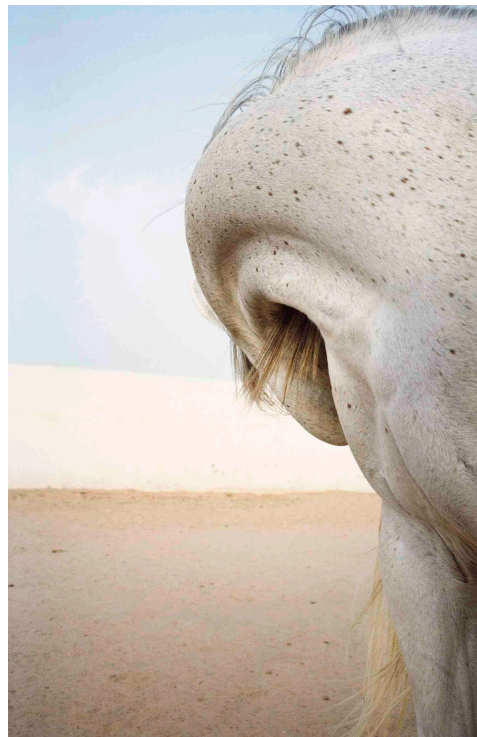
JITKA HANZLOVÁ (*1958), 'Untitled', from the series 'Horses', 2011, archival pigment print

carefully closes in on his or her subjects, the differentiated materiality of which transcends mere mimetic description, such as in Jitka Hanzlová's series Horses .