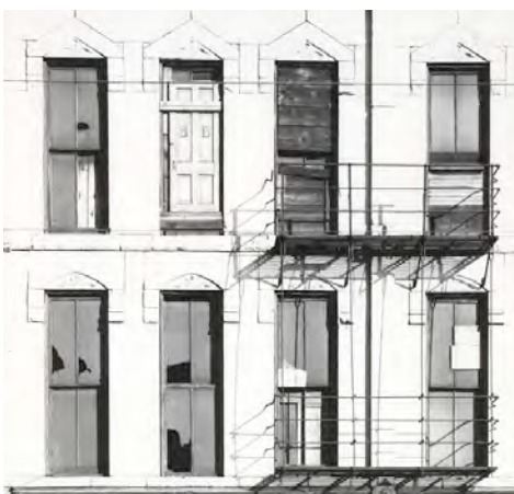
HARRY CALLAHAN (1912-1999), 'Wells Street, Chicago', 1949, gelatin silver print