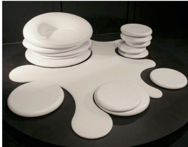
'lo glo' furniture edition by j. mayer h., 2006-2007