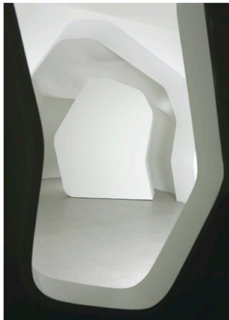
'positive.negative' showroom for kicken berlin by j. mayer h., 2007 (© j. mayer h. / courtesy of kicken berlin)