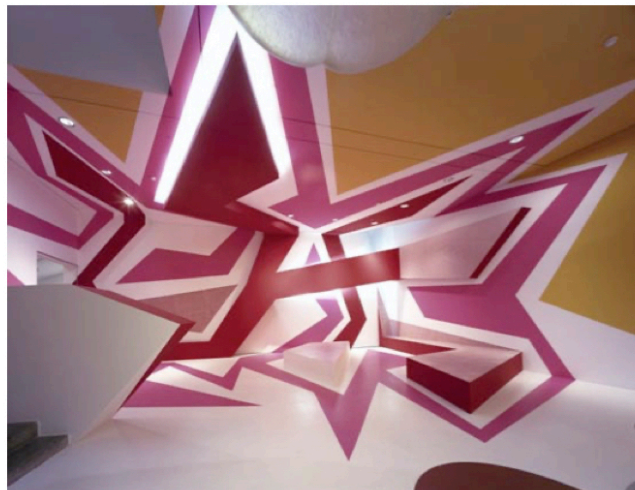
'housewarming myhome' vitra design museum by j. mayer h., 2007