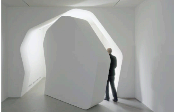
'positive.negative' showroom for kicken berlin by j. mayer h., 2007 (© j. mayer h. / courtesy of kicken berlin)

berlin's kicken gallery will begin a new exhibition of works by ryuji miyamoto and j. mayer h. architects on may 2nd. the gallery was recently transformed by j. mayer h. architects with the addition of a movable two-part element, 'positive.negative', which enables the exhibition space to be modified. in addition to the new space, the architecture firm will display a variety of sketches, renderings and video from the 'positive.negative' project and many others. the work of japanese photographer ryuji miyamoto will also be on show. 'pinhole' is a series of large format crosses rendered in lush blue tones. the photos are taken using a small hut which he transformed into a camera obscura by covering all the interior walls in photo paper. he lies inside the box while the paper is exposed. the show will run until june 7th.